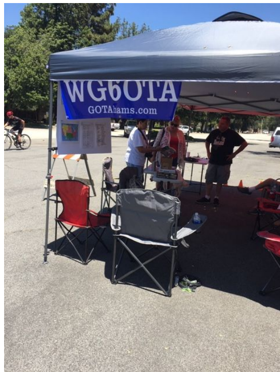
Saturday In The Park