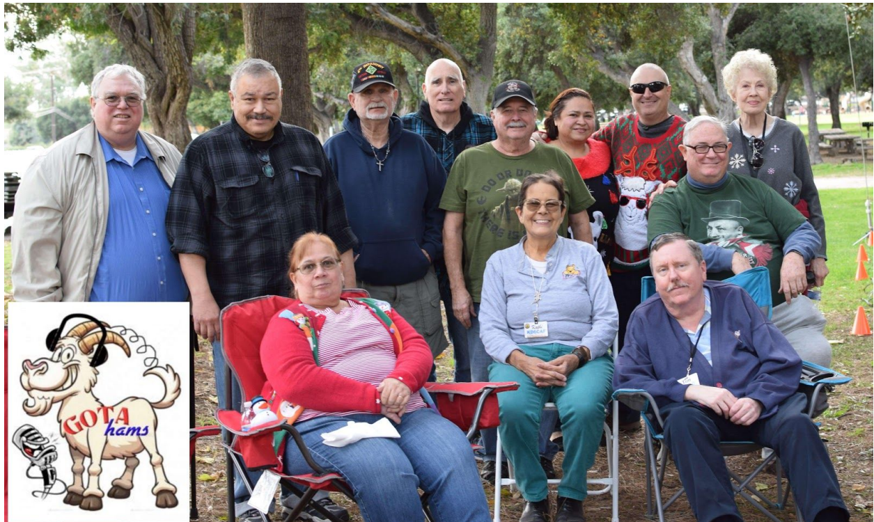
And the Goats gather for the last time in 2019. It was another great outing. We will see everyone at the park next year.